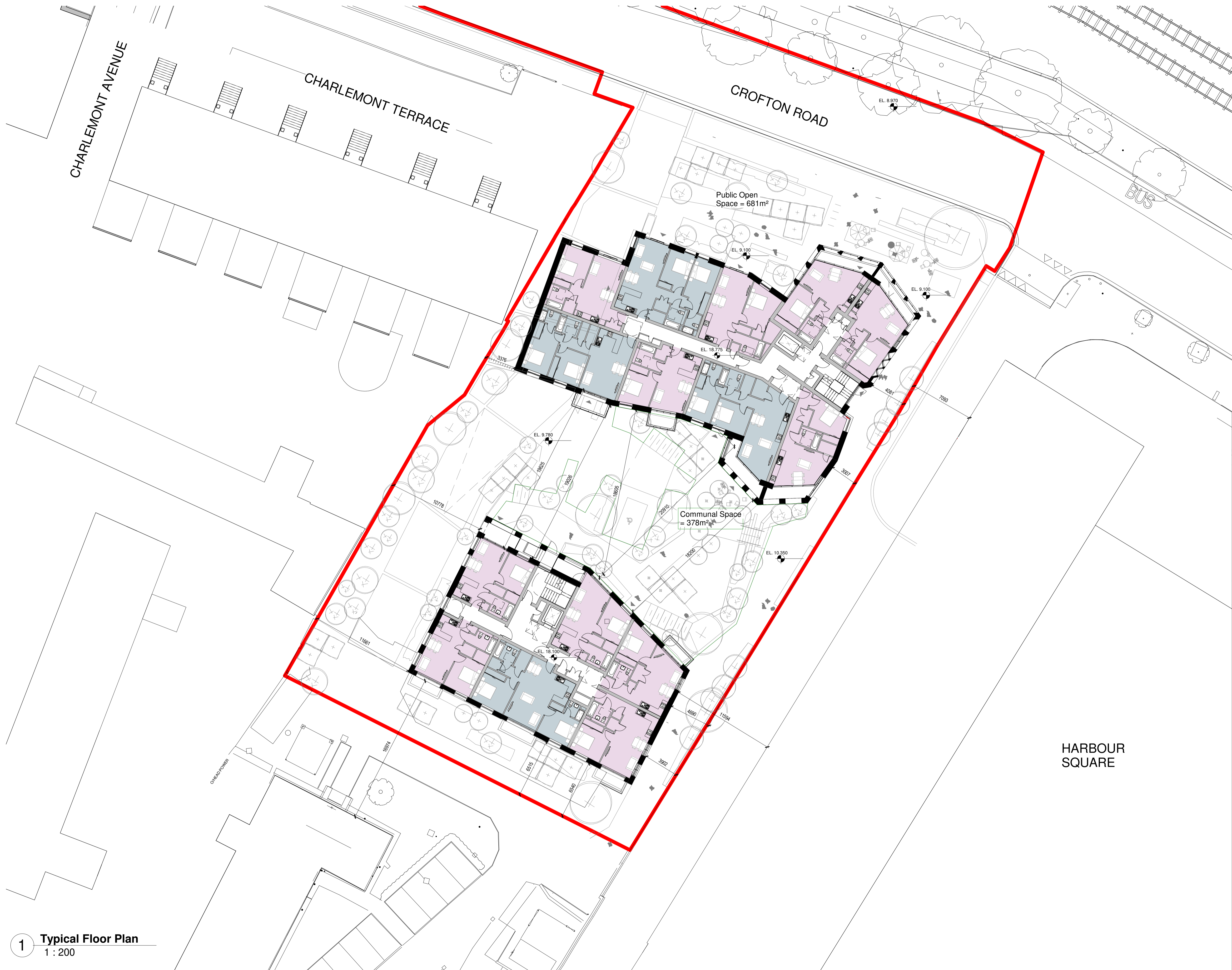
1 Typical Floor Plan 1 : 200

Notes: DO NOT SCALE FROM THIS DRAWING. USE FIGURED DIMENSIONS IN ALL CASES. VERIFY DIMENSIONS ON SITE AND REPORT ANY DISCREPANCIES TO THE ARCHITECTS IMMEDIATELY. THIS DRAWING TO BE READ IN CONJUNCTION WITH THE ARCHITECTS SPECIFICATION. © THIS DRAWING IS COPYRIGHT AND MAY ONLY BE REPRODUCED WITH THE ARCHITECTS PERMISSION.